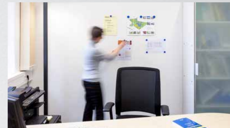
Offices and working spaces