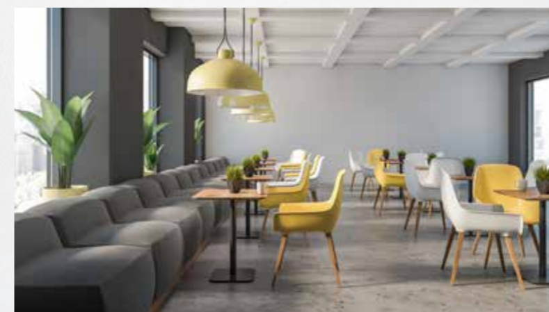
Bars and bistros

Detailed information on SYSTEXX Active Reno online