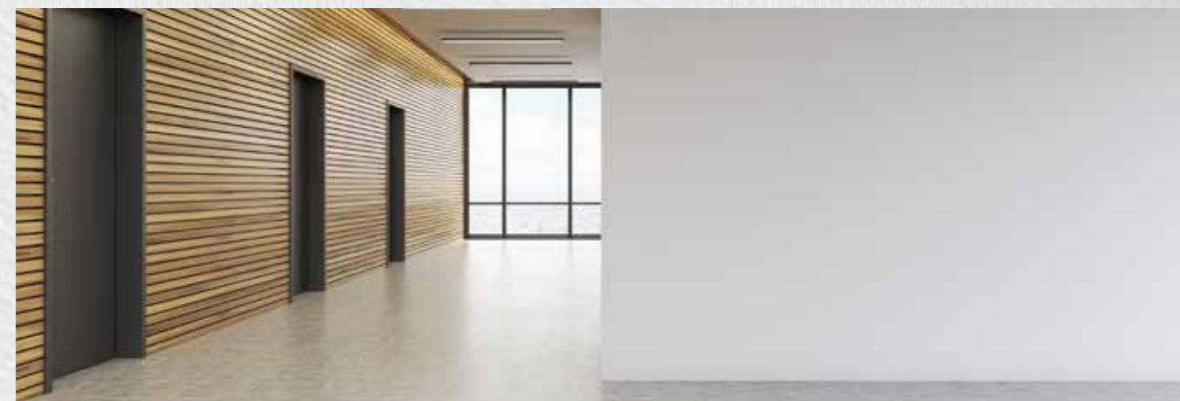
Hallways and paths of travel