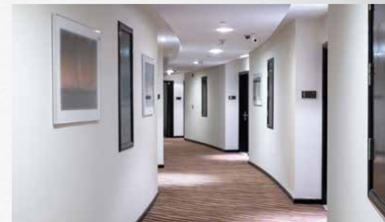
Paths of travel and exit routes