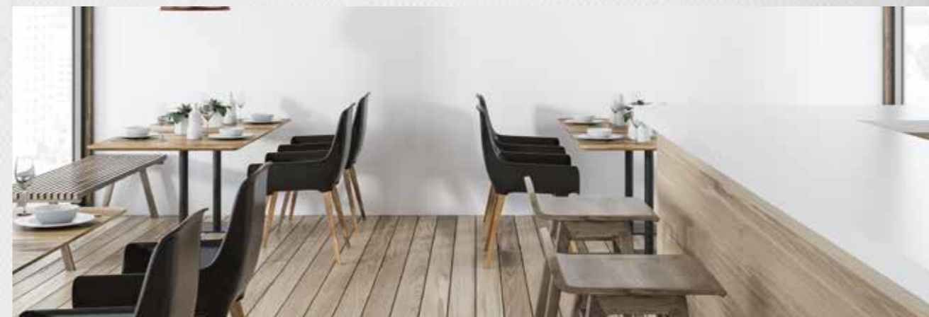
Restaurant and guest lounge