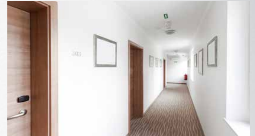
Hallways and paths of travel