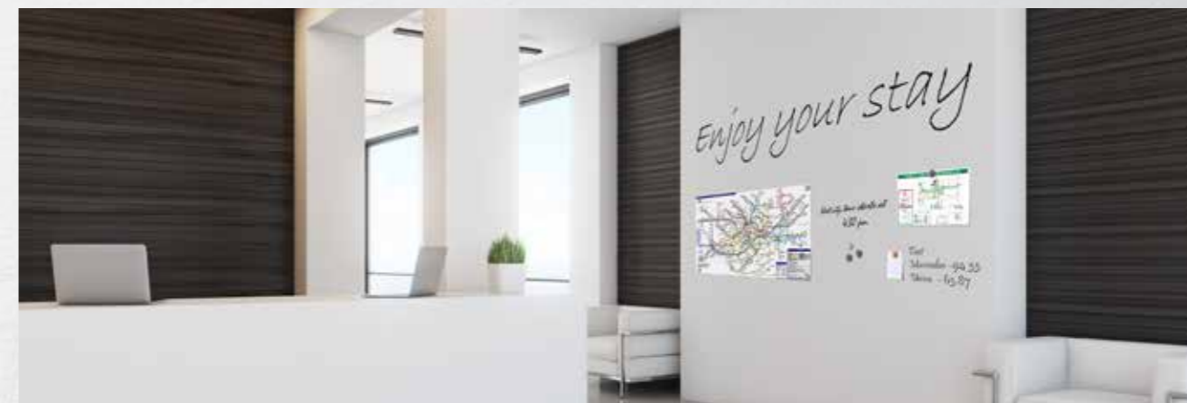
Traffic areas with display boards