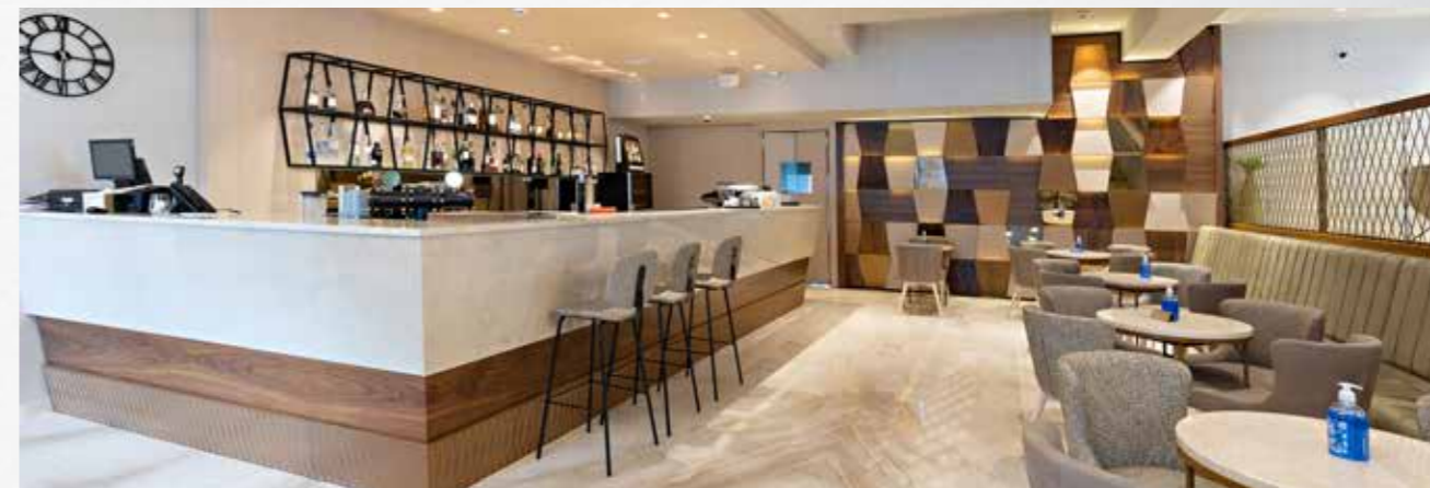
Restaurants and guest lounges