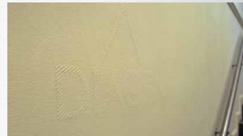
Paths of travel und corridors