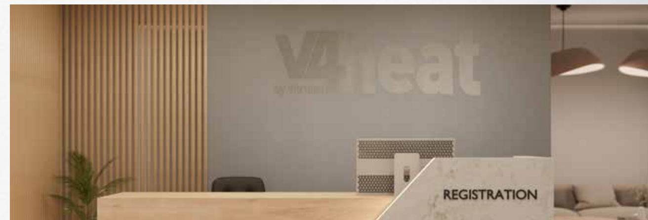
Entrance areas and lobbies