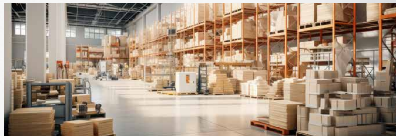
Production and storage spaces