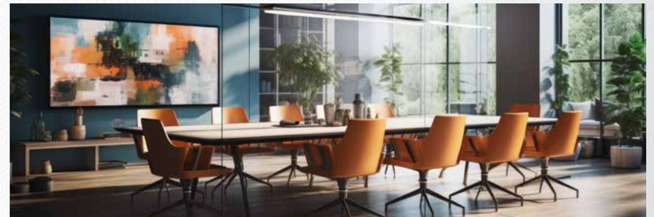
Meeting and conference rooms