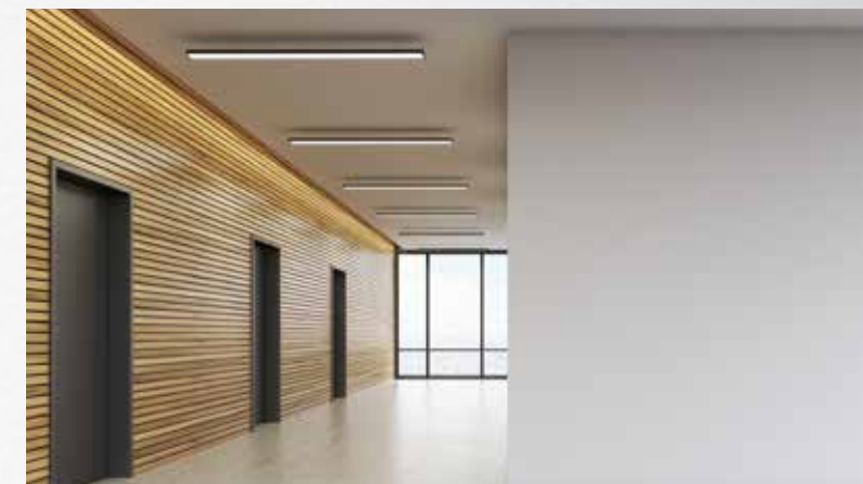
Paths of travel, hallways and exit routes