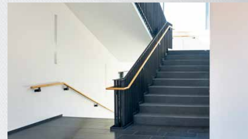
Paths of travel