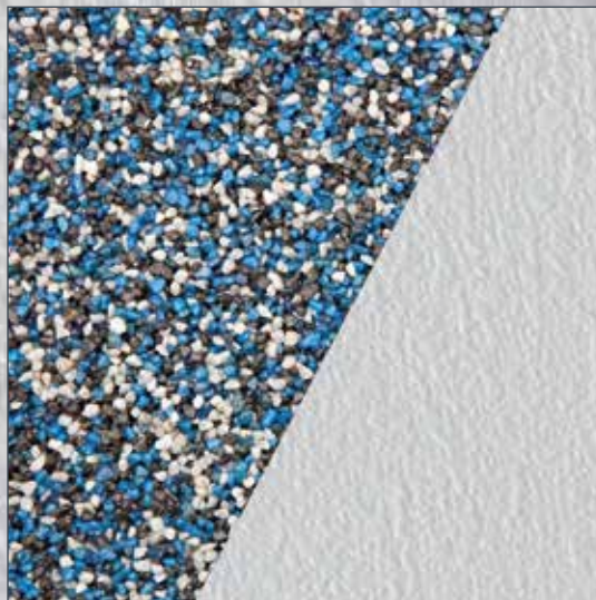
Grit wash finish (up to 2 mm): prime and apply the fabric.