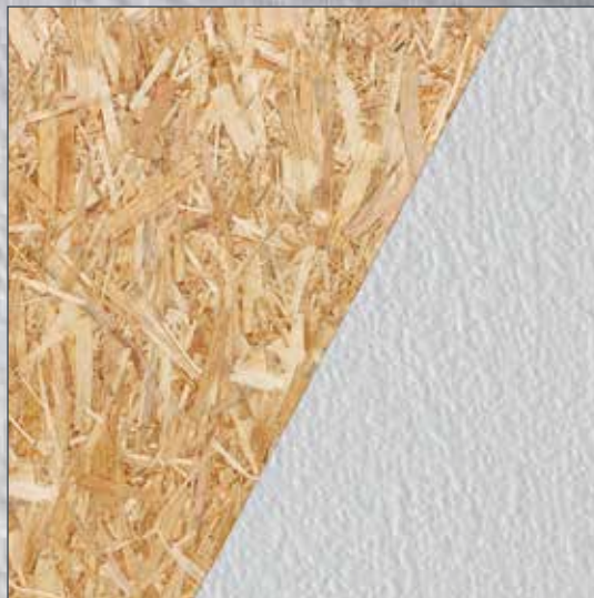
OSB: apply barrier primer, and then apply the fabric.