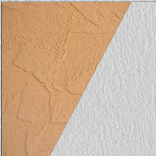
Textured plaster (up to 2 mm): simply apply the fabric.