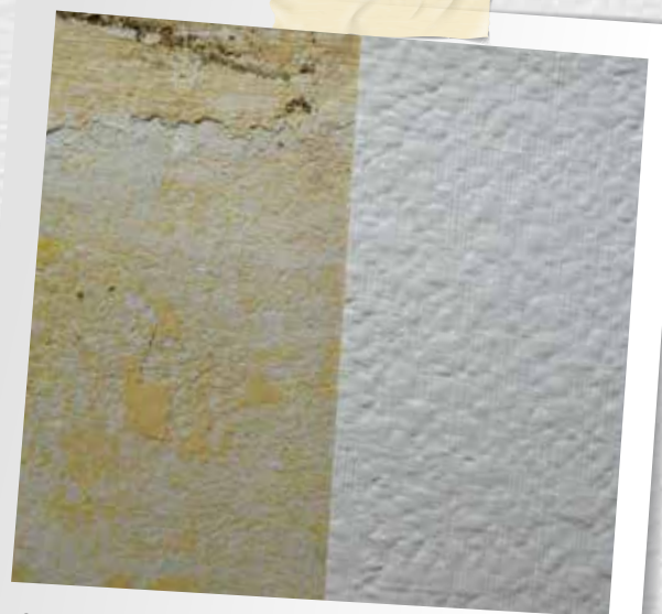
Cracks are simply papered over.

substrate preparations were completed in a day, „then work resumed at a much faster pace than we had anticipated“.