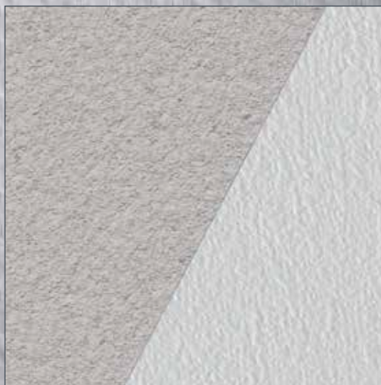
Roughcast (up to 2 mm): simply apply the fabric.