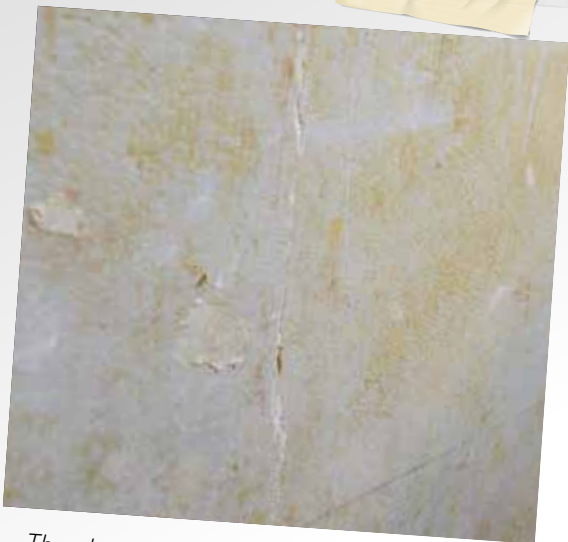
The plaster behind the wallpaper was already showing signs of age.

Under their own steam and with professional help from a friend who is a master painter and decorator, they finally got down to the job in hand: with the old wallpaper stripped off and the larger defects roughly filled, the substrate preparation was complete.