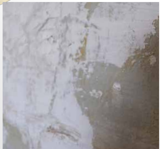
It was enough to roughly fill the worst areas.

The filled-in doorway to the living room didn't need a perfectly smooth finish, so that also saved time. „Finally, we could see the light at the end of the