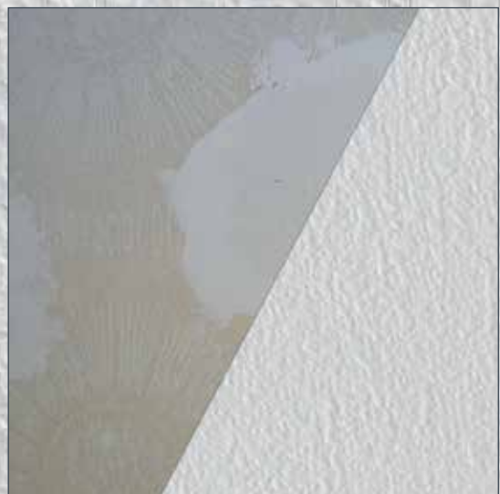
Surface unevenness (up to 2 mm): simply apply the fabric.