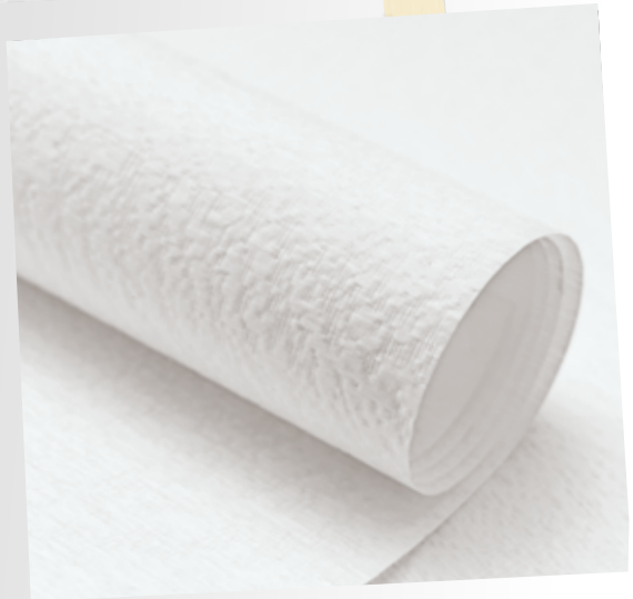
SYSTEXX Active Reno SP38

The idea of a quick and simple renovation seemed to be receding into the distance. The two came across the SYSTEXX Active Reno range while searching for other options.