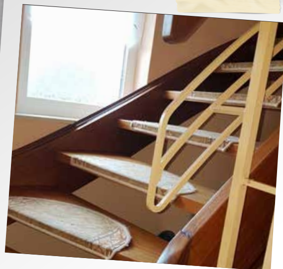
The charming 70s stairwell

While they enthusiastically set about redesigning, refurbishing and decorating the living room and