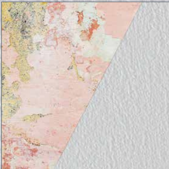
Old wall coverings: remove loose sections, prime and apply the fabric.