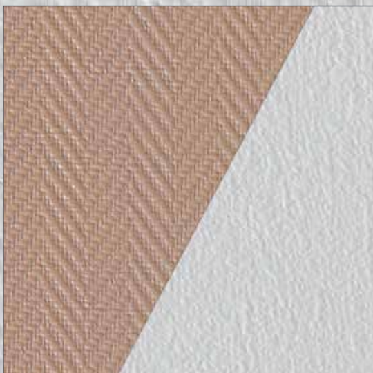
Old glass fabric: simply apply the fabric.