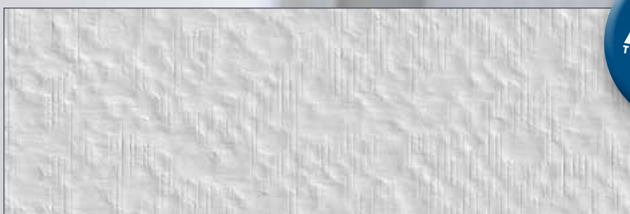
SYSTEXX Active Reno SP38