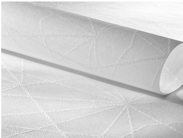
Figure: Representation of product.